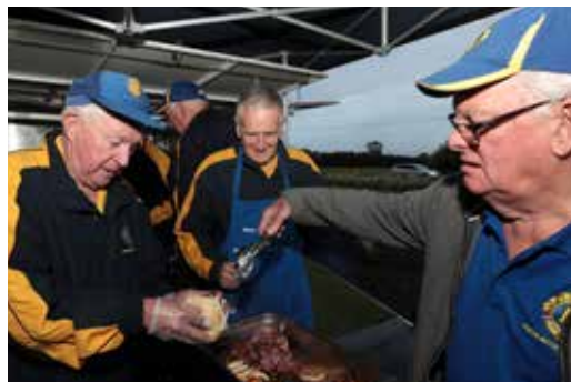
Various members assisting with Lions efforts to deliver community benefits. (bottom left) Delivering Tools to Mallaacoota fire victims (above) cooking at the Portarlington Golf Open and (top) selling raffle tickets to get lobsters.