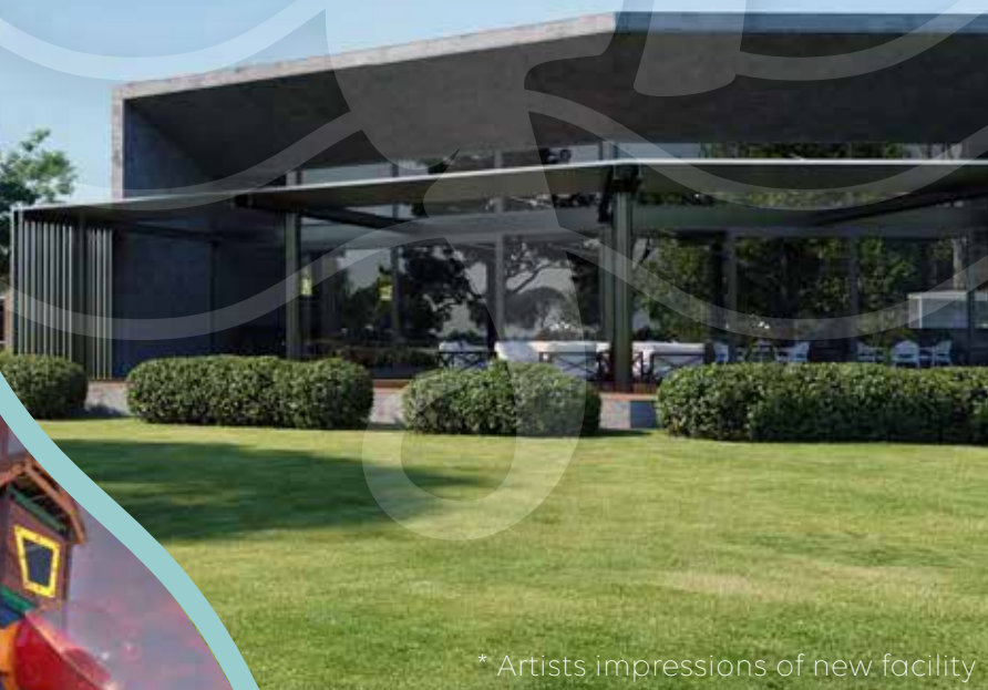
* Artists impressions of new facility